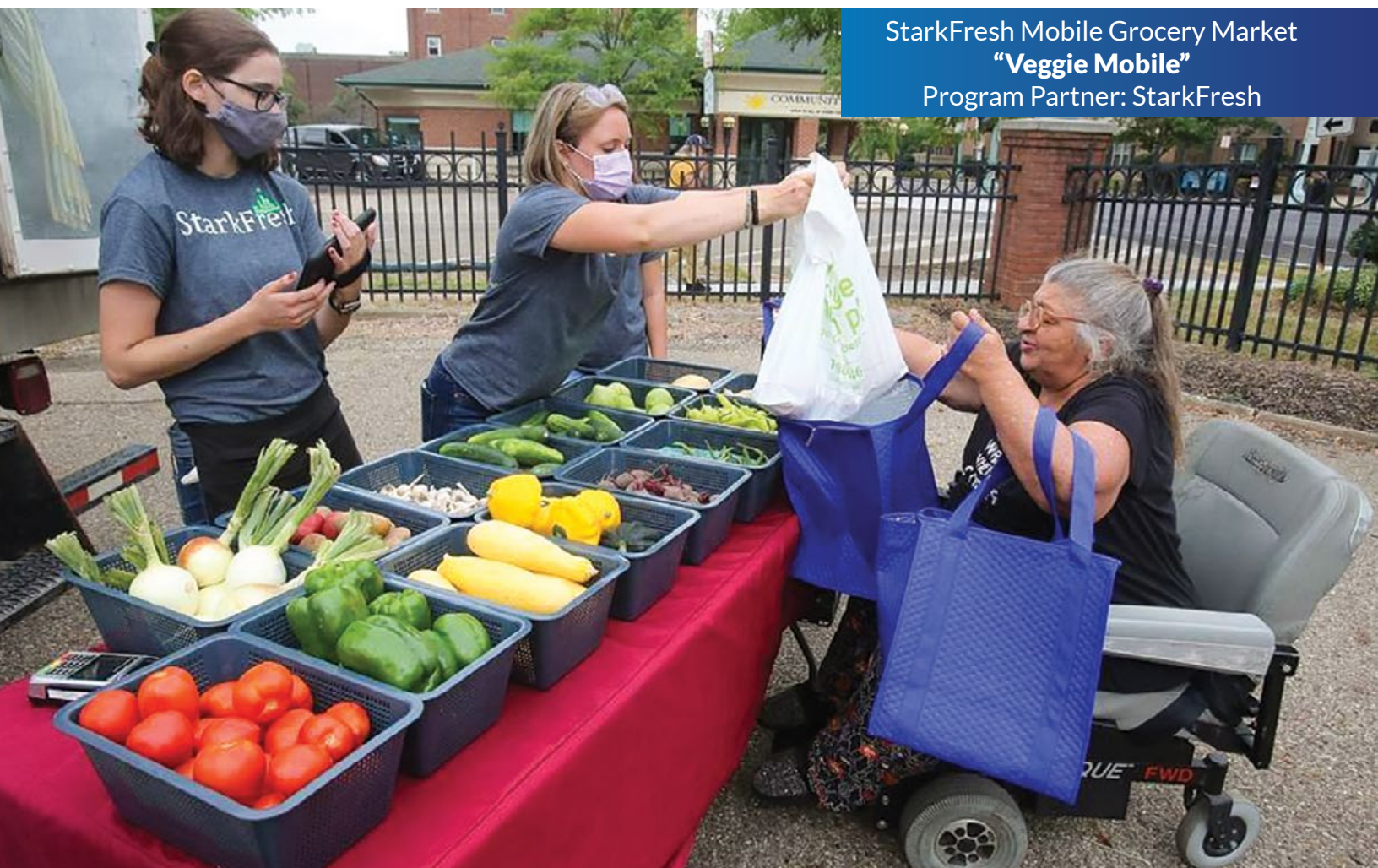
StarkFresh Mobile Grocery Market “Veggie Mobile” Program Partner: StarkFresh